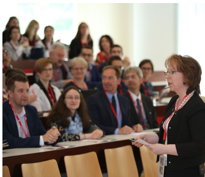
Expand your knowledge and engage in discussions on the latest international and intercultural advancements.