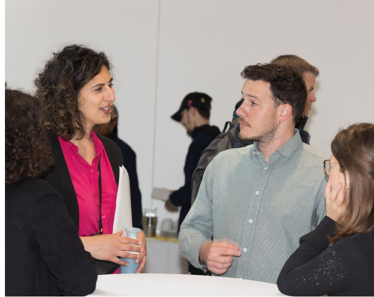
Connect with colleagues from the field, deepen your professional skills, and exchange valuable experiences.