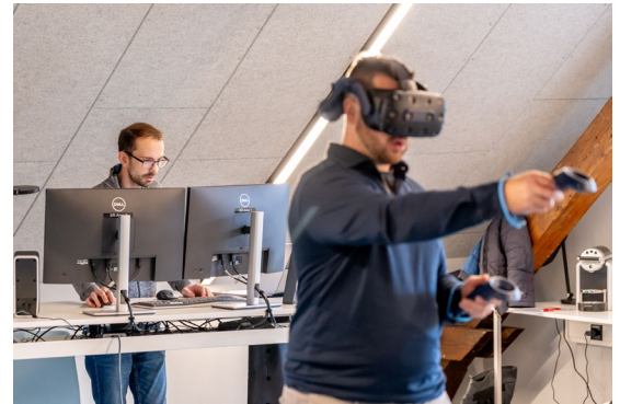
Teach, learn, practice or do all together with our interactive seminars and workshops.