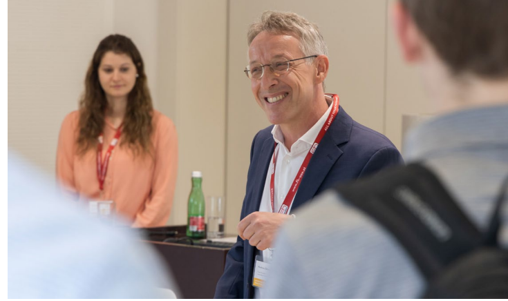
Contribute to engaging discussions and collaborations