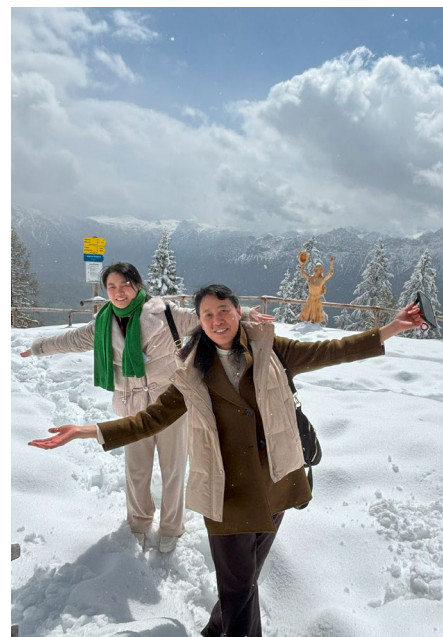
Travel with us to experience breathtaking nature and pure culture of Austria.