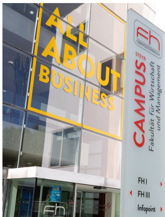
Looking forward seeing you at Steyr Campus!

Nestled in the heart of historic Steyr, 12 minute walk to the university. info@styriahotel.at stadthotel-steyr.at